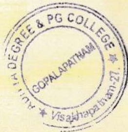
PRINCIPAL ADITYA DEGREE & PG COLLEGE Gopalapatnam, Visakhapatnam-27