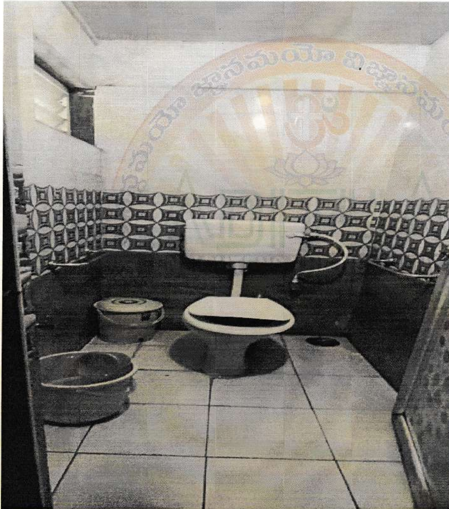
Disabled Friendly Washroom

4. Sound Amplifier: It is an app on Android device with wired headphones to filter, augment, and amplify the sounds in our environment. This app helps to hear better in noisy areas. There are many people with varying degrees of hearing loss but this app tackles the problem, makes it easier to hear. The app uses phone or headphone's microphone to sift through ambient sounds and enhance frequencies related to speech while reducing unnecessary noise.