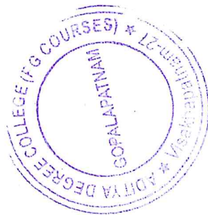
Principal ADITYA DEGREE COLLEGE Gopalapatnam, Visakhapatnam-27