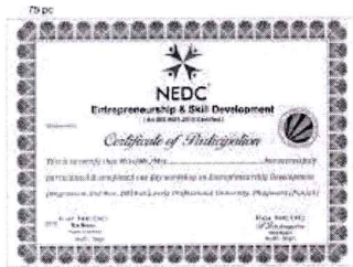
WhatsApp Image 2019-11-01 at 11.03.49.jpeg 284K